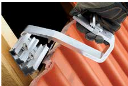
Simple and fast installation with click-in system.