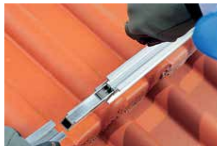
Tool-free installation of rail connector without bolt connection.